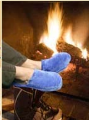
DreamTime Warm Embrace® Body Wrap and Pampered Soles Spa Slippers.

During the entire month of May, the Meeting Point will offer 30% off of our entire line of DreamTime® and Spa Comforts® products.