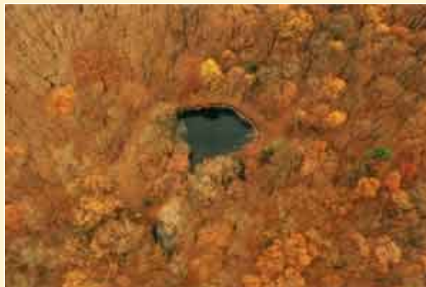
"Autumn Pond" 2009, Lehigh County, PA

Artworks from the show are on sale through the Meeting Point bookstore, which is adjacent to the gallery. Visit the Himmelfarb Gallery online or call 410-888-9048.